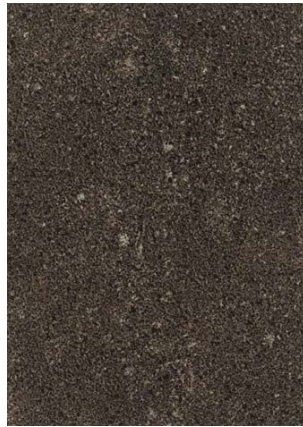
TF5250 NEW ☼ ⓘ