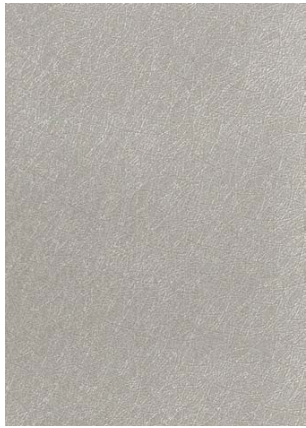
TF5241 NEW ☼ ⓘ