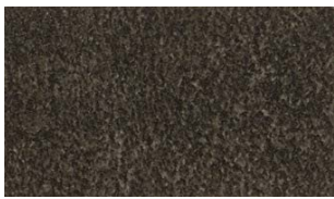
TF5248 NEW ☼ ⓘ