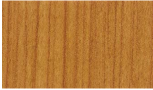
TF4812 ☼ ⓘ Cherry · SF