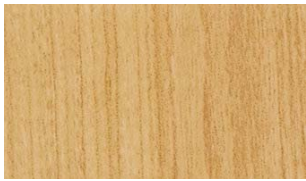
TF4811 ☼ ⓘ Cherry · SF