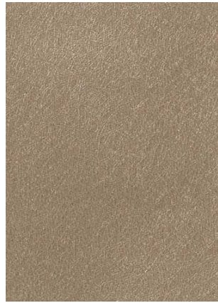
TF5242 NEW ☼ ⓘ