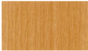
TF4815 ☼ ⓘ Cherry · SG