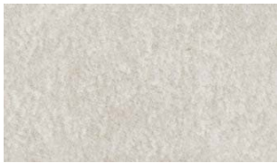
TF5247 NEW ☼ ⓘ