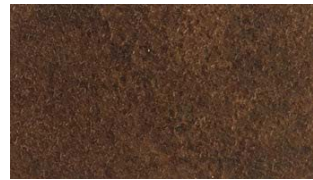
TF5251 NEW ☼ ⓘ