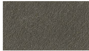
TF5245 NEW ☼ ⓘ