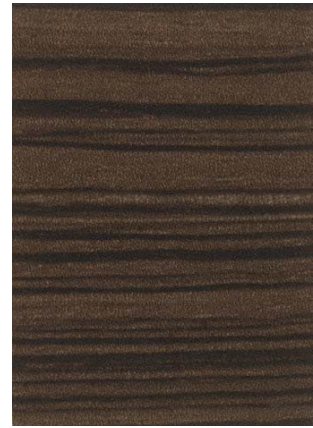
TF4822 ☼ ⓘ Zebrawood · SG