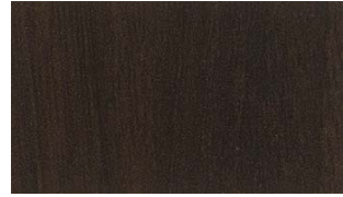
TF4821 ☼ ⓘ Walnut · SG