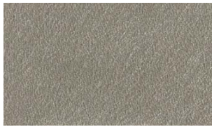
TF5243 NEW ☼ ⓘ