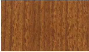
TF4816 ☼ ⓘ Teak · SF