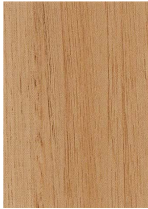
TF4819 ☼ ⓘ Walnut · SG