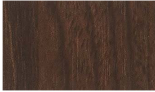
TF4817 ☼ ⓘ Teak · SF