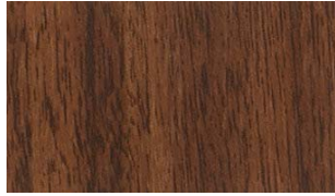
TF4820 ☼ ⓘ Walnut · FG