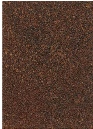
TF5249 NEW ☼ ⓘ