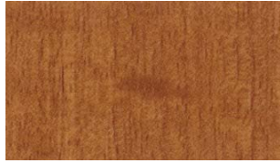
TF4813 ☼ ⓘ Mahogany · SG